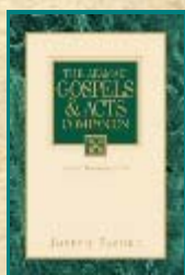
The Aramaic Gospels & Acts Companion - a text transliteration